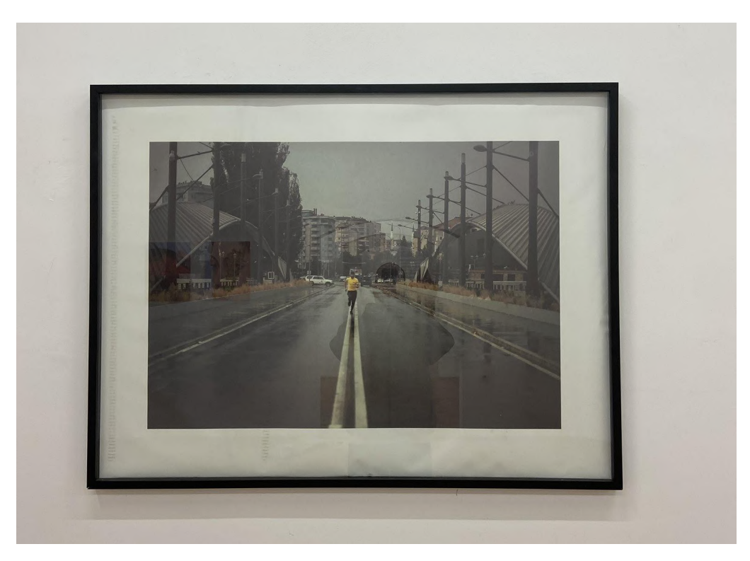
4 Stefan Lukić - "By your side"