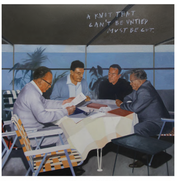
All Hands on Deck oil on canvas, 50×50 cm, 2022