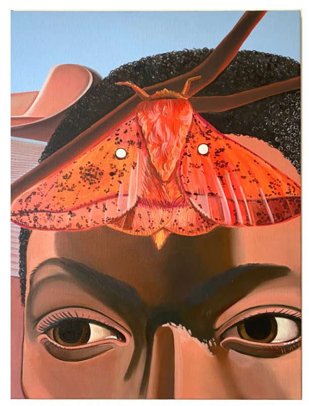
'Umwelten Gap (Oakworm Moth)'