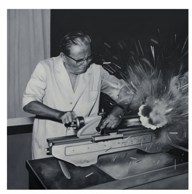
State Control oil on canvas, 50×50 cm, 2022